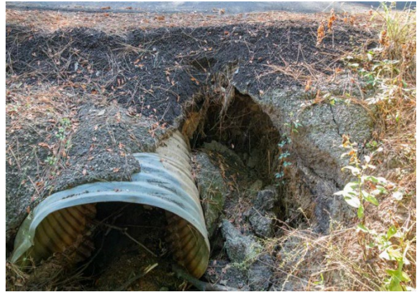
Evidence of erosion around a culvert.