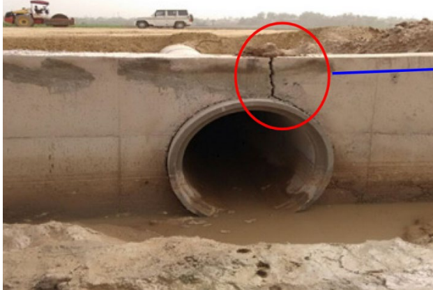
A crack in the culvert headwall.