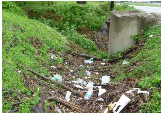
Litter and debris within a swale.