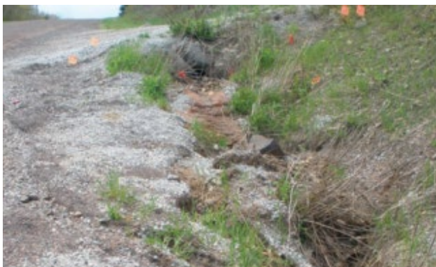
Erosion and slumping within a drainage ditch.