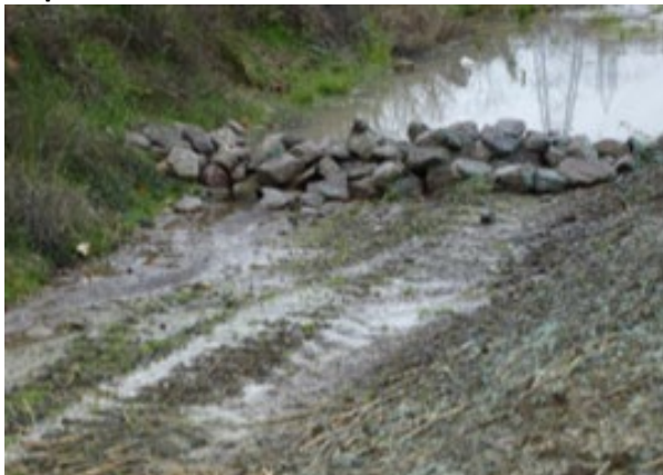
Rock check dam across a channel.