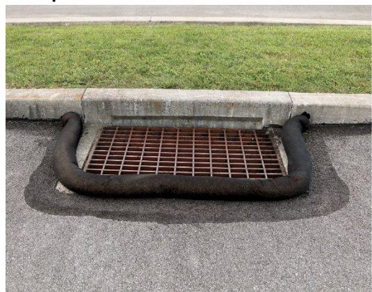
Example of an inlet filter sock, replace if damaged.