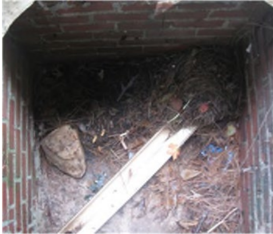
Sediment and debris inside stormwater inlet