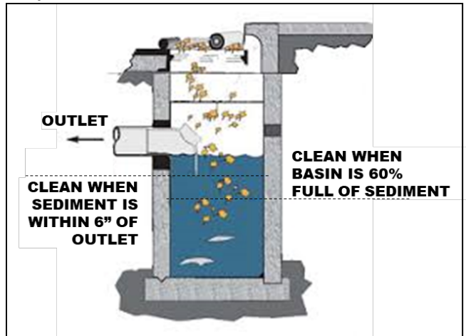
Remove sediment from a catch basin if it fills 60% of the sump or comes within 6" of a pipe.