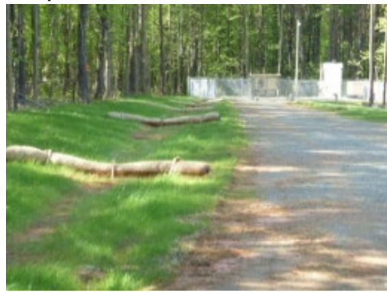
Filter sock check dams across a grass swale.