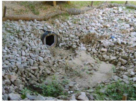
Sediment accumulation at swale inlet.