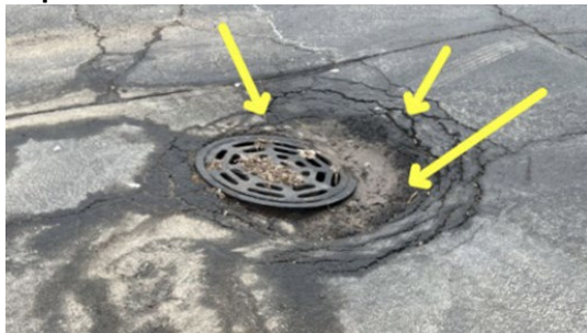
Failing asphalt surrounding the inlet