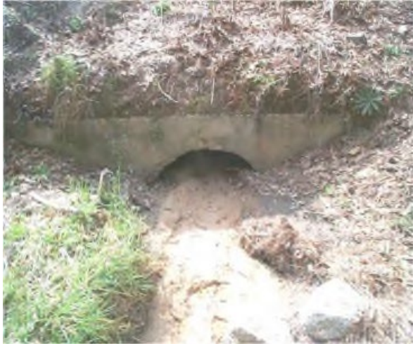
A pipe filled with sediment, inhibiting flow.