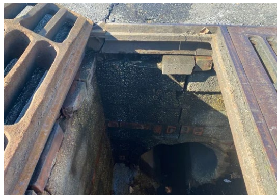
Failing brick walls with a stormwater inlet.