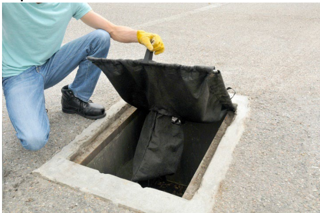
Example of inlet filter. Replace when filled or damaged.