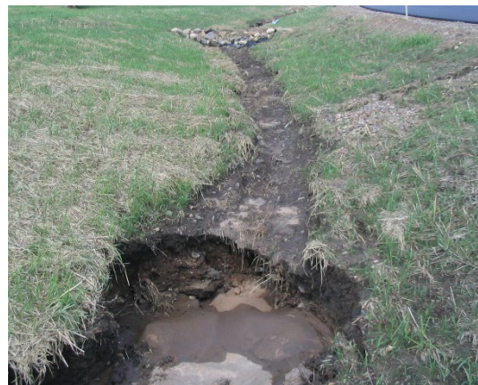
Slumping within a drainage swale.