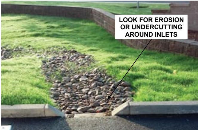
Inlet to a rock-lined swale.