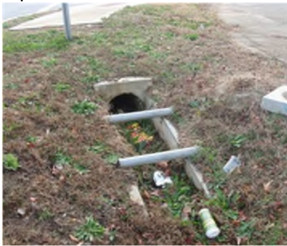
Pipe conveyance filled with vegetation.