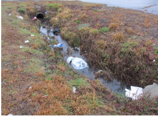
Litter and debris within a ditch.