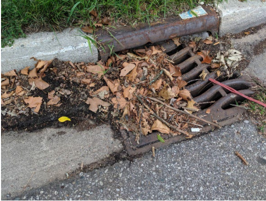
Debris and sediment blocking inlet/catch basin grate.