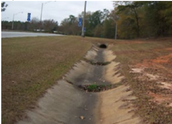
Cracks and joint separation in concrete channels, removal of vegetation may prevent future damage.