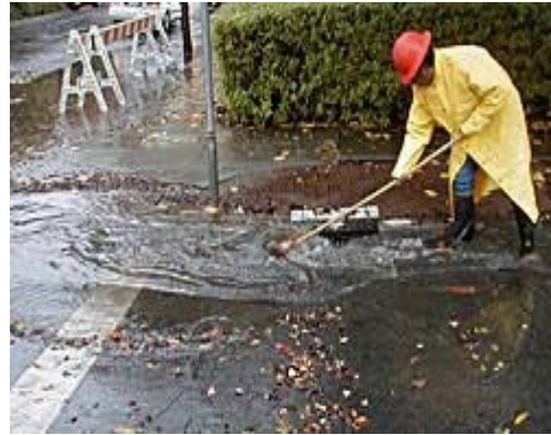
Standing water around an inlet may indicate a blockage.